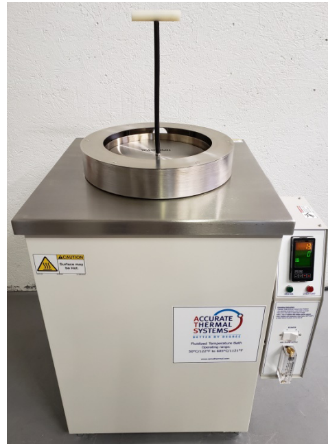
Model FTBSL15 with particulate collar