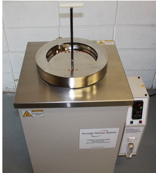
Model FTBSL15 with particulate collar