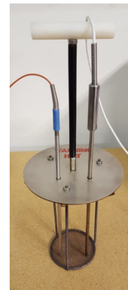
Bath Lid with Probe support

The lid is easily modified for immersing apparatus, assemblies and small reactors for heating.