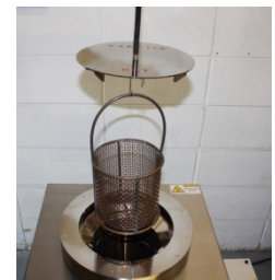
Bath Lid with Parts Basket